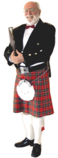
The only celebrant offering Scottish weddings including ancient wedding ceremony